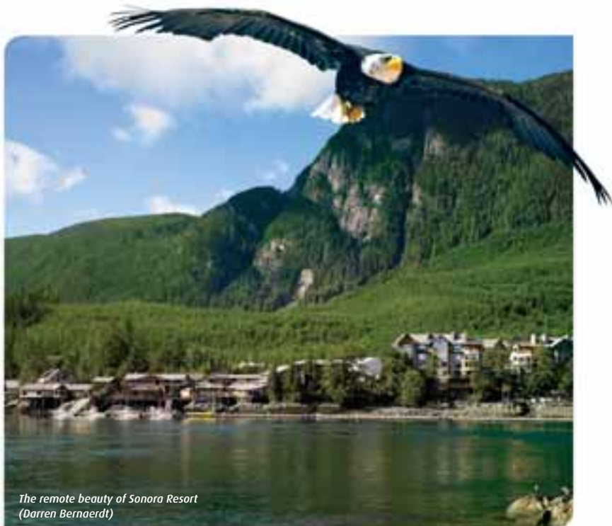
The remote beauty of Sonora Resort

Phone: 604.233.0460, Fax: 604.233.0465 Toll Free: 888.576.6672 info@sonoraresort.com