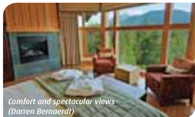
Comfort and spectacular views (Darren Bernaerd)

After a 45-minute flight from Vancouver by floatplane, you are welcomed on the dock Sonora-style—with genuine warmth from staff. Unwind in elegant lodges and enjoy classic Pacific North West fare. The meeting spaces include a native Longhouse, a new business centre and breakout rooms (all WiFi connected).